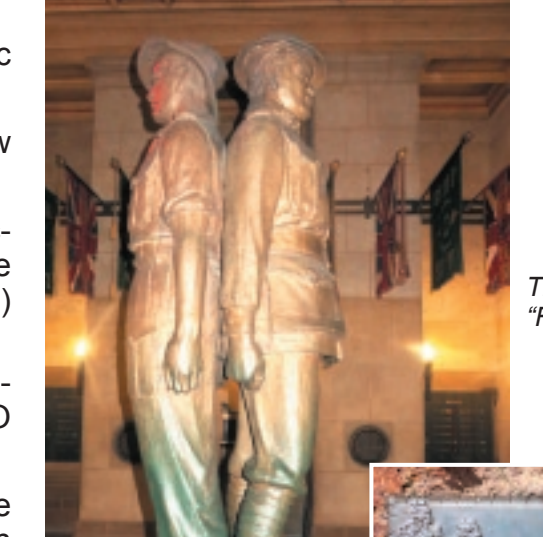
The bronze "Father and Son" statue.

The Shrine also serves as a military museum with panels listing every Australian unit that served in the Imperial Forces along with artifacts from major military engagements.