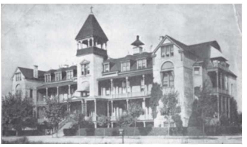
Anyone in Pierce County who "took real sick" from the 1918 flu would likely have been sent here: the first St. Joseph's Hospital—located, as The regular flu came its modern incarnation is today, in Tacoma's "Hilltop" neighborhood.