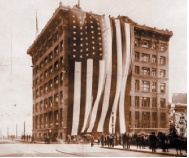
November 11, 1918: Giant American flag on Tacoma's Perkins Building celebrates the end of World War I. Crowd is small, however, due to the ban on public assemblies caused by the influenza crisis. Photo cour-

tastrophe like other, the board has little good news for the governor or the public," the Washington State Board of Health reported to the governor in its annual report. "The Spanish flu in Washington has taken 4.879 lives in the last three months of 1918. of whom more than half were adults between the ages of 20 and 39... The