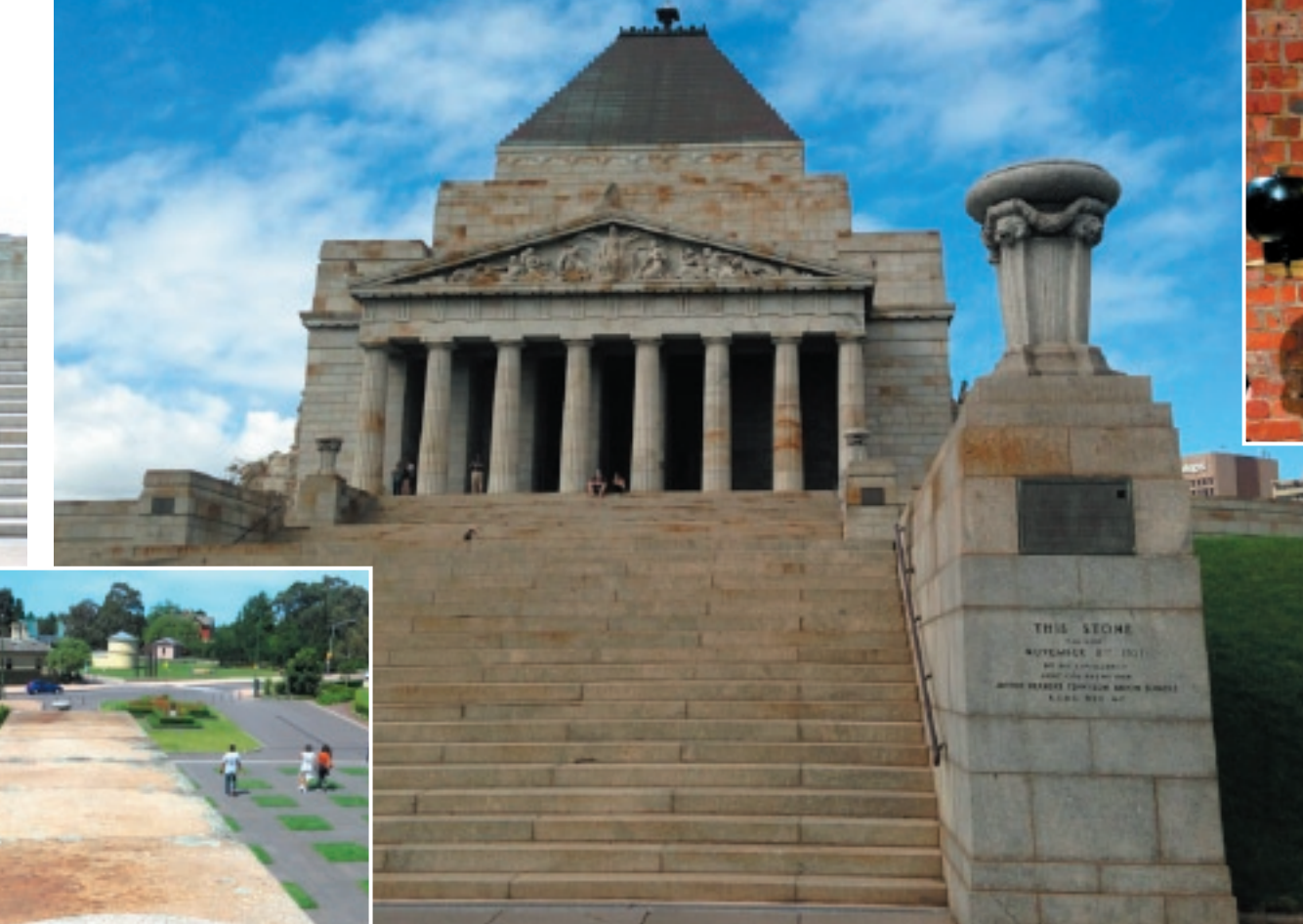
Front view of Shrine with 1927 dedication stone.

Tribute to World War I "Battle of Ypres" in Flanders Field, Belgium.